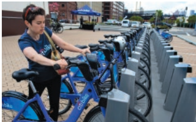
BILL PEDUTO, MAYOR OF PITTSBURGH.