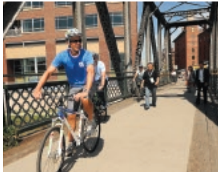
2008 CONVENTIONEERS MAKE USE OF FREEWHEELIN BIKE SHARE PROGRAM.

Active transportation has stayed on the city's agenda in part because grassroots advocates have continued to grow in strength.