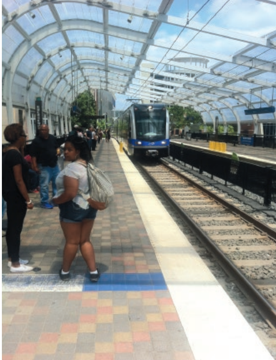
LYNX LIGHT RAIL SYSTEM. DOUG CLOUSE.

There is promise. First, public opinion swings in the transportation innovation direction. Even without a strong civic organization advocating for public transit, the public consistently supports sustainable transportation. In 1998, Mecklenburg County voters agreed to a half-cent tax to finance the 2025 Integrated Transit/Land-Use Plan, which included many of the light rail projects that were constructed as well as zoning for transit-oriented development. Even when a small anti-tax campaign tested the appeal of the transit tax in 2007, Mecklenburg residents voted again to keep the tax, with 70 percent voting for it compared to 30 percent against. True to form, major corporations (Duke Energy, Wachovia, Bank of America) and other firms that would directly benefit from the transit investment