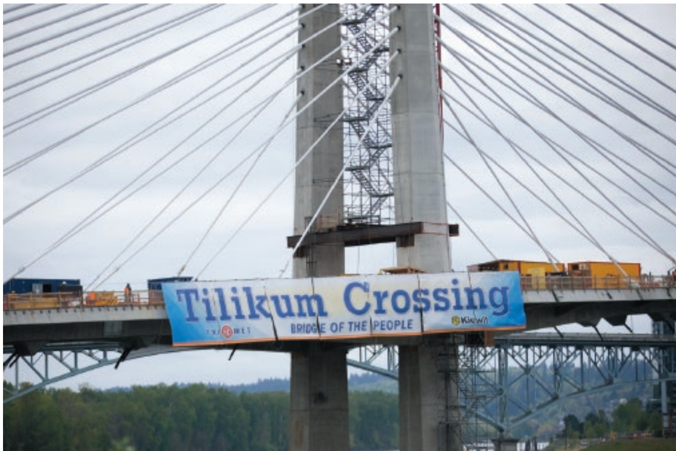
TILIKUM CROSSING, THE “BRIDGE OF THE PEOPLE,” WILL CARRY LIGHT RAIL TRAINS, BUSES, CYCLISTS, PEDESTRIANS, AND STREETCARS, BUT NOT PRIVATE VEHICLES.

defeat of the Mount Hood Freeway project: start with land-use decisions and provide guidance for practical “doability” rather than prescriptive solutions. Portland has had the benefit of financial resources for these projects since the beginning of its transformation, but strains are showing now that those federal funds have run their course. Portland’s elected leaders, its citizens, and its culture of planning have helped the city progress through economic and policy peaks and troughs. While today’s progress may not be as dramatic as tearing down highways, what makes Portland stand apart is that for decades after its initial burst of innovation in the early 1970s, it has carved out a wholly different path of urban development.