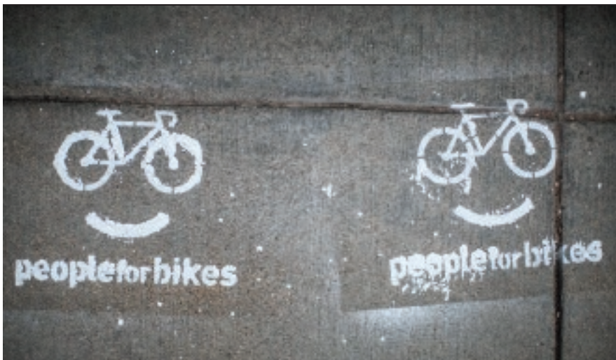
PEOPLE FOR BIKES, DENVER.

But providing evidence is not enough. Civic organizations must convert innovations birthed in the advocacy realm into ideas ready for adoption by politicians. Often this happens through the hard work of gathering public input, integrating various opinions, and baking those views into politically palatable programs. More pedestrian space was enshrined into mayoral agendas by transportation advocates on Rahm Emanuel's and Bill de Blasio's transition teams in Chicago and New York, respectively, by focusing on increasing safety. Bike Pittsburgh's bike map