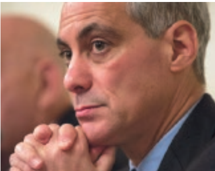
CHICAGO MAYOR RAHM EMMANUEL'S TRANSITION TEAM INCLUDED SEVERAL PROGRESSIVE TRANSPORTATION ADVOCATES.

In a city with a rich history of ambitious plans, CDOT was noticeably lacking one. In its twenty years of existence under Daley, CDOT had never drafted or implemented a comprehensive plan. Even CDOT's vision statement, drafted at its