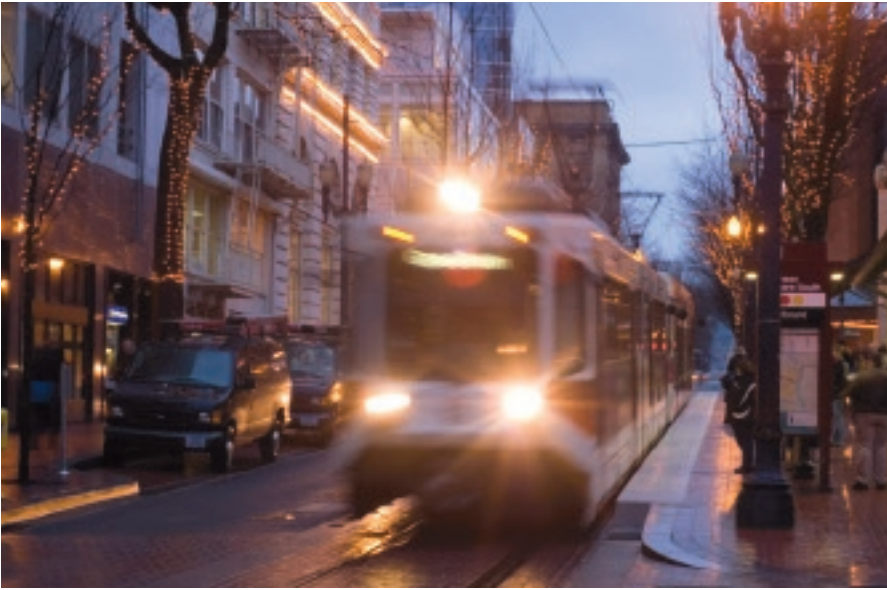
PORTLAND DOWNTOWN.

A change in federal transportation policy gave the locals the positive argument they had previously lacked. Under the 1973 Interstate Transfer Provision of the Federal Highway Act, a result of a compromise stemming from congressional disagreement over the level of state control of federal transportation funding, the city and state could for the first time transfer the set-aside federal funds intended for the Mount Hood highway project to other regional transit and highway projects. Previously, saying no to an urban highway also meant saying no to hundreds of millions of federal dollars. For the first time, a