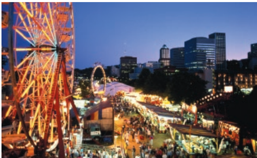
PORTLAND'S TOM MCCALL PARK AT NIGHT.

Perpetuate new norms through changing agency standards. For reforms to outlast mayoral terms, they must eventually be codified into agency practice—that is, its standards, processes, performance measurements, and day-to-day operations. Leaders at all levels need to push for new practices to be officially adopted and carried out. Successful reformers must redefine how the success of a transportation system is measured so that all subsequent practices meet the same standards and achieve a similar reformist goal. Groups like the National Association of City Transportation Officials have an important role to play in this step.