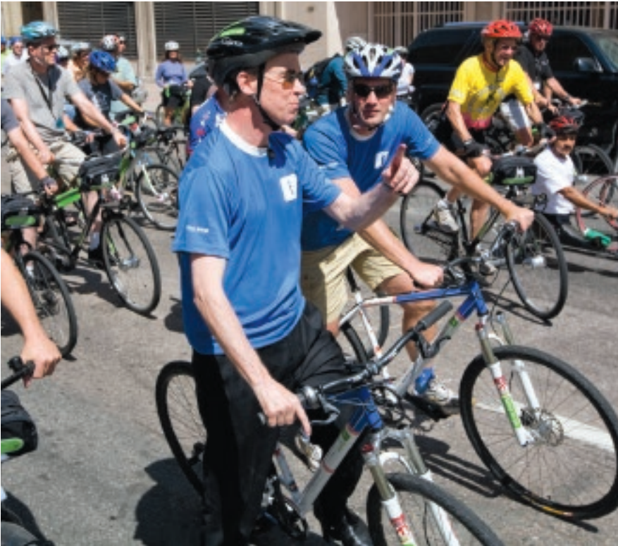
FORMER DENVER MAYOR JOHN HICKENLOOPER LEADS A GROUP OF BICYCLE ADVOCATES.

1973. Though the law was created to protect natural resources, the creation of urban-growth boundaries limited the outward expansion of urban areas, focusing local planning efforts on more efficient uses of urban land. By fostering compact land-use planning practices that inherently supported sustainable urban transportation, Oregon essentially built durability into urban transportation innovation. The key is that the state policies were passed at the moment the civic sector was fully engaged and local politicians were aligned. It sounds obvious, but without local engagement, local execution of state and federal policies is much more limited.