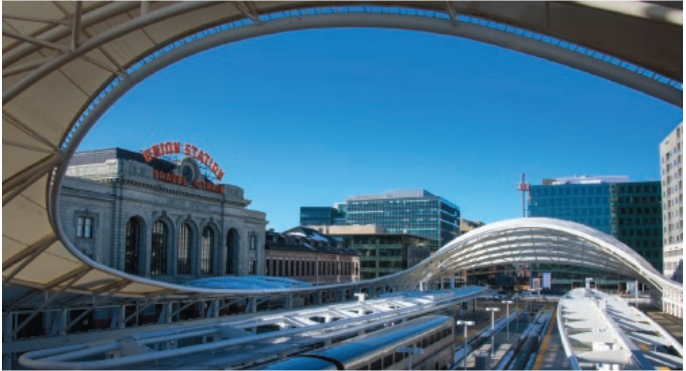
DENVER UNION STATION.

Denver is known for having one of the most collaborative regional politics in the country.