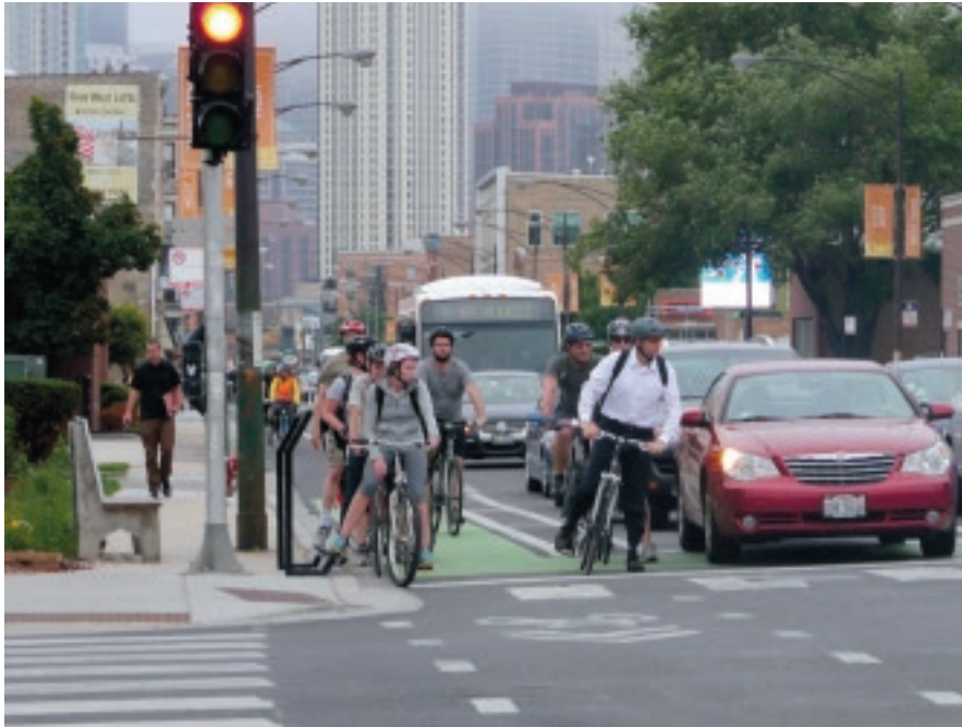
IT TOOK FOURTEEN YEARS TO DRAFT A SUCCESSOR TO THE 1992 BIKE PLAN.