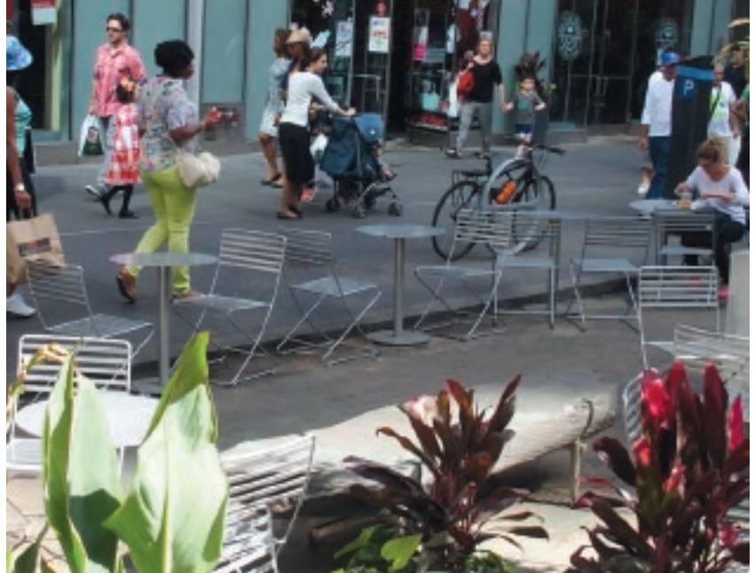
PEDESTRIANIZED ZONES NEAR TIMES SQUARE, NEW YORK. BILL DEERE.