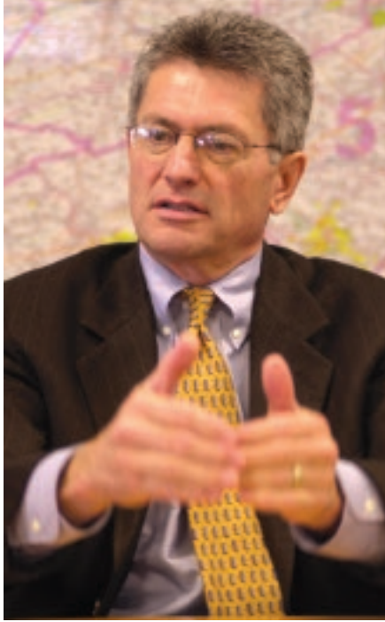
ALLEN BIEHLER, FORMER SECRETARY OF TRANSPORTATION, STATE OF PENNSYLVANIA.

transportation projects than a typical TIP in the state's history (State Smart Transportation Initiative 2011). In the Pittsburgh region, the Southwestern Pennsylvania Commission (SPC) received three separate grants for sidewalk, transit, and highway improvements. Nonetheless, in the absence of coordinated local leadership, the program only marginally affected the transportation landscape in Pittsburgh.